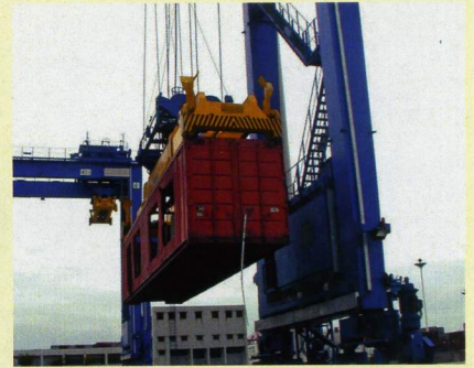
Figure 4: The sway control unit developed by Ruppel allows container cranes to work faster, so that the unit very soon pays for itself.

The latest generation of this sway control system is fitted with electronic control. This allows more accurate, proportional adjustment and monitoring of the system pressure. The result