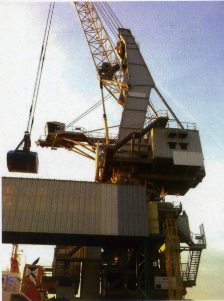
Figure 2: This automated crane used in bulk goods transfer required high levels of positioning accuracy for its derricking boom and grab.

is that any tendency to sway is prevented even more effectively, and the crane does not just work faster, but also uses less energy. This is because swaying motions inject unwanted kinetic energy into the sub-system of lifting gear, load-carrying unit and load, which the crane then eliminates by applying its brakes.